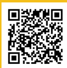
New Life Stories

Scan the QR codes to view more video stories from our grantee partners